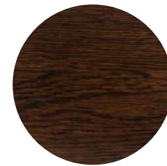
Milano Walnut Oak