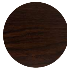
Dark Oak Ash