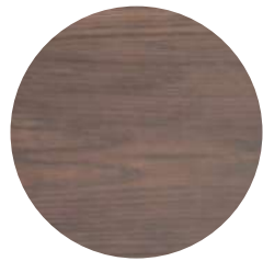
Grey Wash Oak